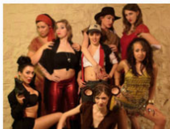
Slideshow: TEMPLE OF THE BOOBS: An Indiana Jones Burlesque