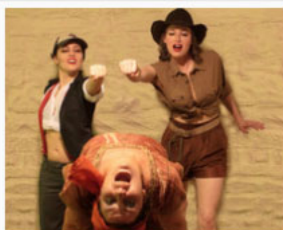
TEMPLE OF THE BOOBS: An Indiana Jones Burlesque